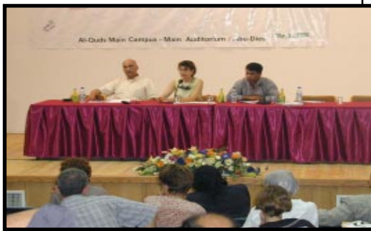
Photo: al-Quds University workshop, June 2000

Refugee Rights Workshops: Kalandia Camp (24 March) - Al-Quds University Law College (10 June) - Camp No. 1/Nablus (18 June):