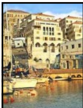
Photos: Jaffa today

vene. At that time there was no military units on our side only some police force hired by the British to enforce local law and discipline. [...] We also encountered some irregular armed men who were carrying rifles and moving in the opposite direction. We later found out that these were volunteers who were joining other groups in order to try to defend the country. Most of the irregulars were not trained for their mission, because the outburst of violence was sudden and people were caught off guard.