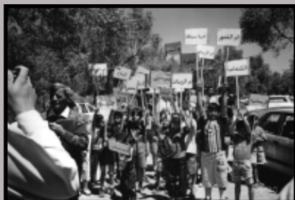
Umm al-Zeinat visit, May 15, 2000

Umm al-Zeinat was among the 10 largest villages in the Haifa district. The villagers depended for their livelihood on agriculture and animal husbandry, grain, vegetables and fruit trees. In the early days of the 1948 war, Zionist forces dressed in British army uniforms carried out an attack on the village. Umm al-Zeinat was captured on 15 May 1948. The Jewish settlement of Elyaqim was established on the southern side of the village site. The houses have been reduced to rubble, but the village cemetery is still visible.