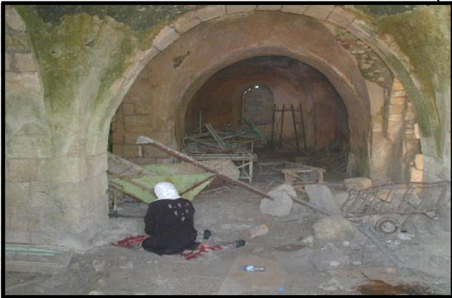
Photo: Silent prayer at the mosque in Zakariyya, June 2000