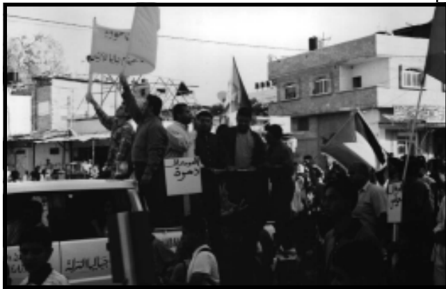
Photo: Nakba Day March in Jabalya, Gaza. May 15, 2000 (Gerhard Pulfer)

Massive protests and violent confrontations with the Israeli occupation army on 13-15 May involved Palestinian civilians and police forces and resulted in six Palestinian deaths and hundreds of injuries.