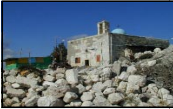
Photo: Church of Ikrit with rubble of the destroyed village

to send a fact-finding mission to investigate the status of the Palestinians property, to appoint a Custodian to monitor changes to such property and report periodically to the UN and finally to activate the UN Conciliation Commission on Palestine. This action by the Arab League should now be activated and updated.