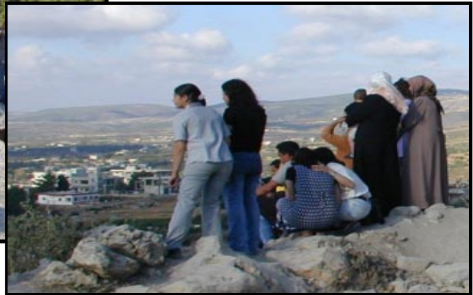
Photo: Palestinians inside Israel look for relatives, refugees in Lebanon, May 2000