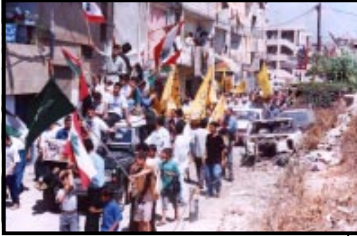
Photo: Nakba March in Beirut, May 15, 2000

Palestinian Refugees Visit their Villages on the Anniversary of al-Nakba