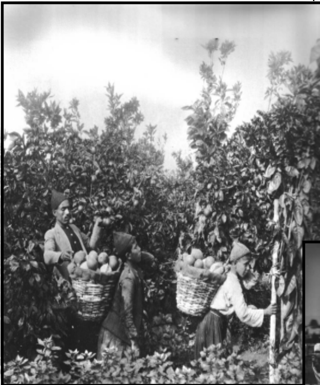
Picking Jaffa oranges

together before and without any real problems. I remember when I stayed for a few days with my older sister who lived near the Lod airport. She was married to a communications engineer who was working at the airport and they lived in compound with other airport employees, many of whom were Jews. I used to play with the Jewish children in the compound. They were very nice; they sometimes exchanged chocolate candies for my falafel sandwiches. They did not look different and they even played the same games as us. That was why I could not understand the reason for the conflict with these people. What had happened?