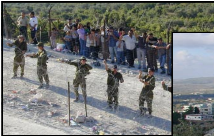
Photo: Israeli soldiers constructing a second fence to prevent Palestinians from reaching their relatives on the Lebanese side of the border, May 2000

arms of two young men. She came from Palestine. Bending down to the earth with flowing tears, she took a handful of sand and threw it over her face, to feel, remember, and meet with it. She simply was living her own yearning and love. Lifting up her head with tears still flowing, she shouted as she discovered some of her relatives, but not those whom she had expected to see. Her brother passed away, as did her cousin, but his daughter was there with her young son. "I'm the last of the old generation dear aunt," she said. The aunt asked about them one by one, never forgetting a single name. She was able to meet them now, but they were all gone. She cried again, cried from the meeting that was not complete, maybe cried from the wound that cut deep into her weak body of 90 years old that insisted on penetrating the wired fence. The road was rough. You could see that people were wearing their new clothes, fit for the occasion. It is a family visit flooded with love and prevention. From inside the one meter separating both sides, you can hear a flow of names flying through the air, "My name is so and so..., I'm looking for such and such person...do you know him?" Words were not directed towards a specific person, but only hoping for a positive reaction from the other side.