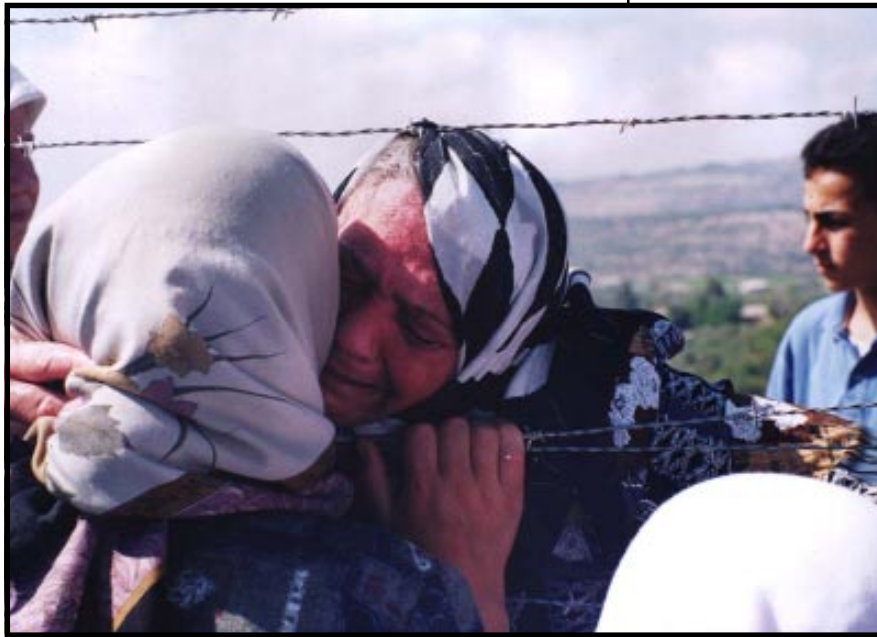
Photo: Embracing across the barbed wire fence, May 2000