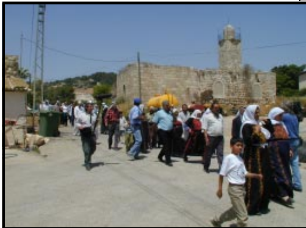
Photos: Return visit to Zakariyya (above), picking wild herbs in Bayt Nattif (top right), dancing the dabke in Bayt Jibrin in front of the "return tent" (bottom right)

the return caravan gathered at the well-preserved mansion of Sheikh Abdelrahman, located on a hilltop overlooking the lands of Bayt Jibrin. A large tent, symbolizing the refugee experience, was set up, and the women distributed traditional Palestinian bread baked in shadow of the old Palestinian mansion.