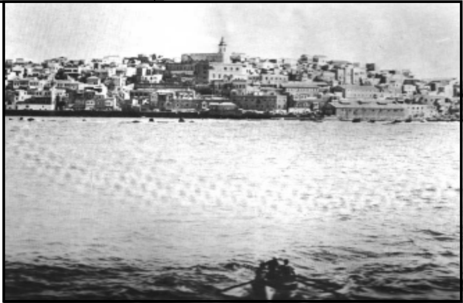
Photo: Jaffa from the sea ( Before Exile . Walid al-Khalidi, Institute of Palestine Studies. Beirut, 1978)

within me resentment to the status quo. Why would somebody throw a bomb in the market place? So many people were around and so many were injured. A few were killed. The Arab news later accused the Zionists of the bombing; the Jewish news denied it.