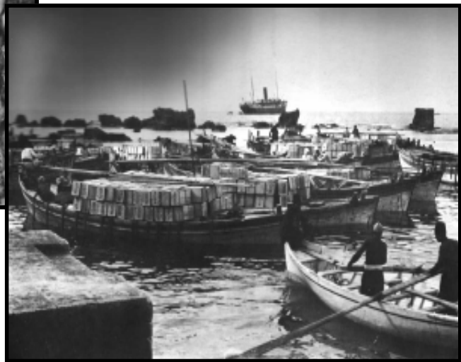
Photo: Jaffa harbor ( Before Exile . Walid al-Khalidi, Institute of Palestine Studies. Beirut, 1978)

Many of the evacuees carried all kinds of personal possessions. The men carried things on their shoulders, the women on their heads. Some walked fast while others were very slow because of the old men and women in the group. Fathers carried children on their shoulders. Others rested on the side of the road. You could hear the children crying, maybe because of hunger, thirst or exhaustion from the trip. We stopped many times to pick up older people on the road and drop them off at well-known places close to Ramallah, where they would later be picked up by their relatives.