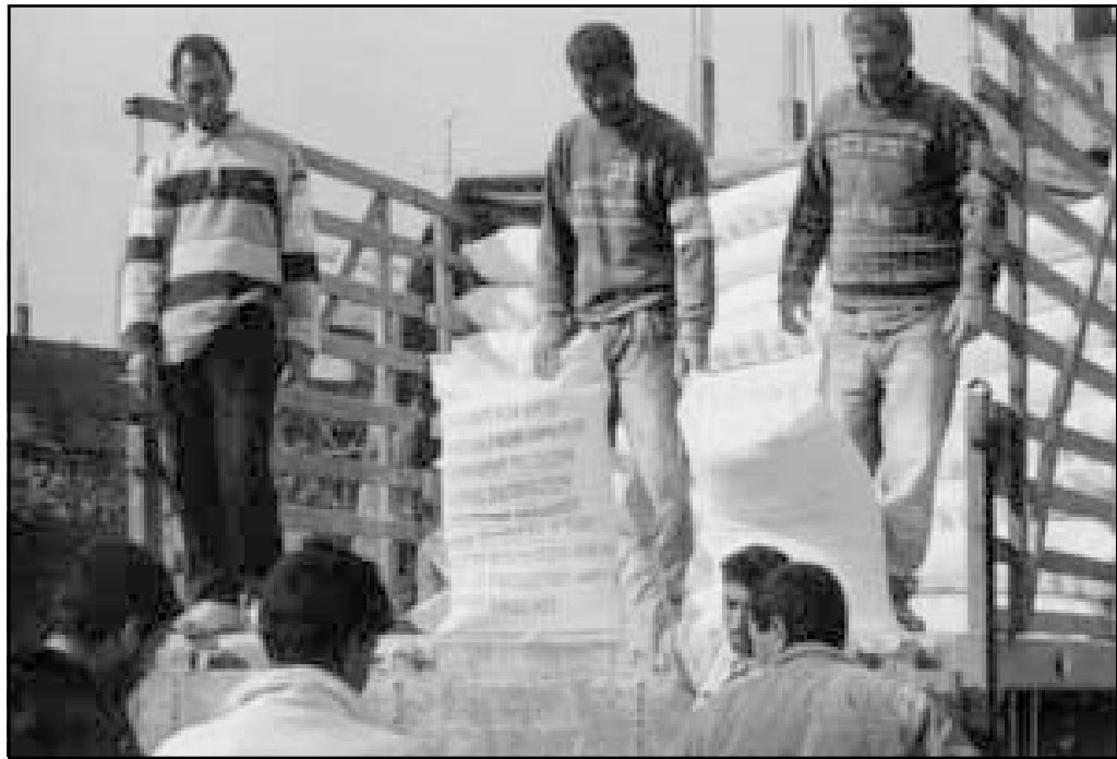
Outside the emergency food distribution centre in the Gaza Strip

supplies, equipment, and services such as mobile medical teams, physiotherapy and prosthetic devices. For the first time UNRWA is also providing psychological support and counseling services for traumatized Palestinian refugee children. In the West Bank it is estimated that UNRWA will have to assist some 1,500 permanently injured refugees with rehabilitation. By the spring of 2001 Refugees' demand for drugs and emergency supplies in the West Bank increased by some 45% over normal conditions. Four mobile medical clinics have provided services to over 22,000 refugees unable to reach UNRWA facilities due to Israel's military closure. In Gaza two mobile teams have treated 1,200 injured refugees since October 2000.