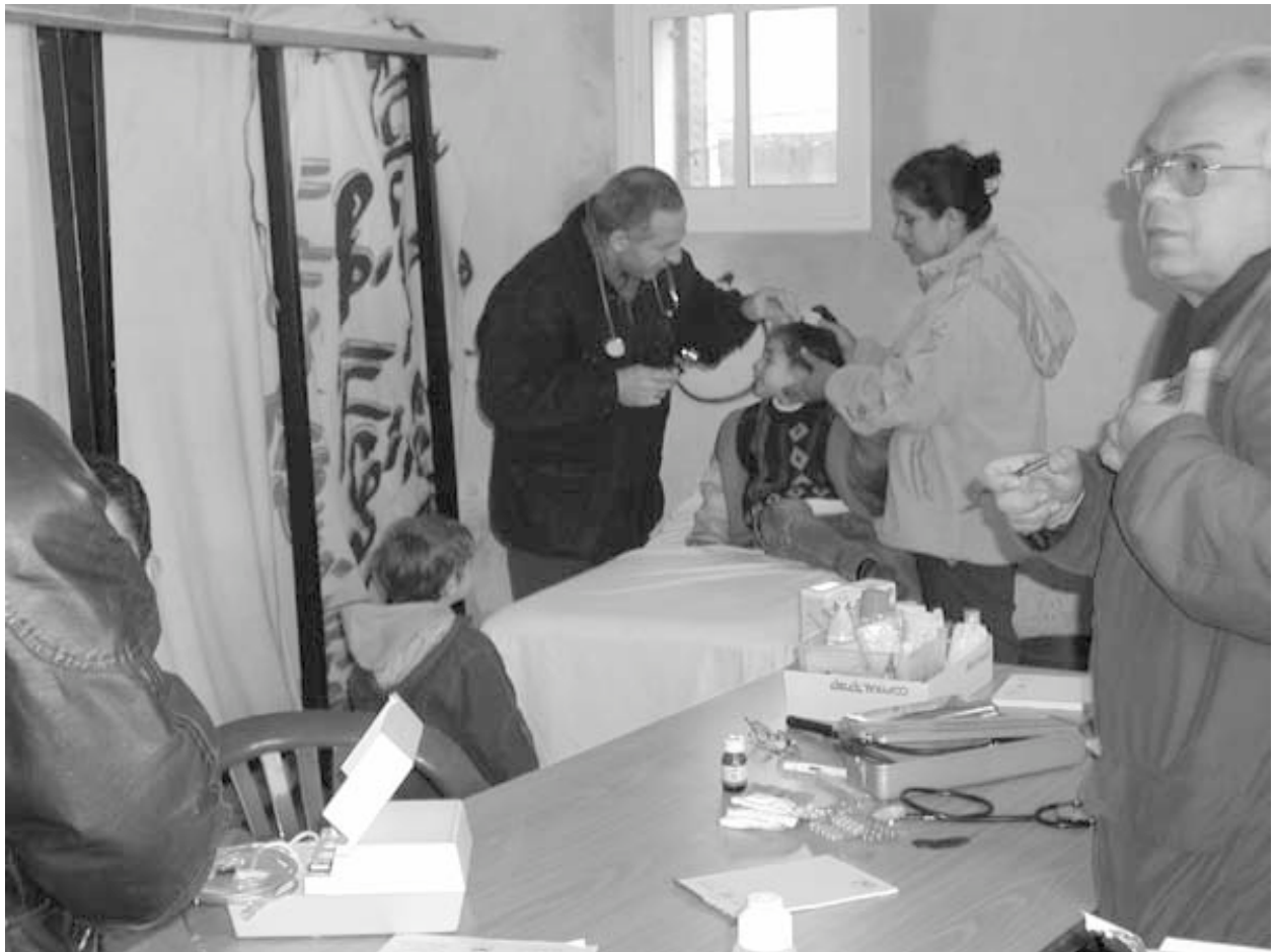
Voluntary Health Clinic in Deheishe Refugee Camp in late February 2001

for emergency assistance through UNRWA and other international agencies.