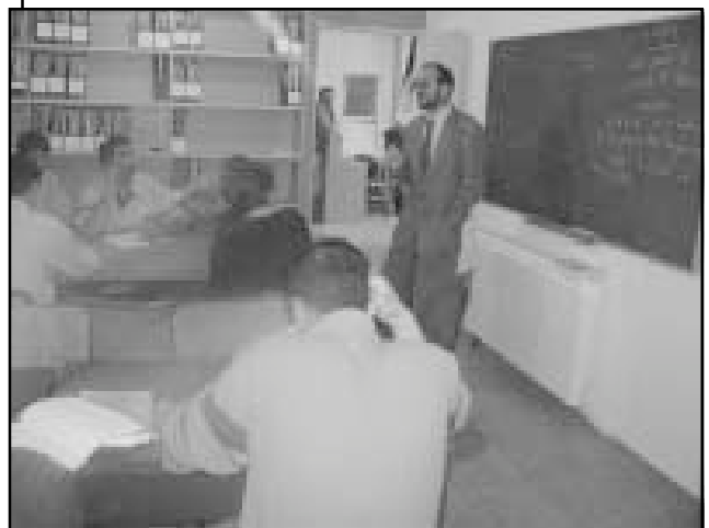
Beginning in February 2001 BADIL has provided assistance in English training for students in Bethlehem-area refugee camps studying for their tawjihi exams

Contributions (in kind and financial) to homeless refugee families: In cooperation with the Follow-up Committee on Refugee Affairs - Southern West Bank, BADIL contributes to the provision of emergency supplies (blankets, clothes, etc.) and to the reconstruction of refugee homes damaged by Israeli shelling.