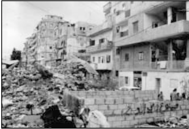
Shatila Refugee Camp in 1998

Lebanese by nationality, she was cut off by her family for marrying a Palestinian. During the Battle of the Camps, Amal militiamen vented their anger against her by killing her only son. The apartment she lives in is not her own, and when its owner returns she will have to find somewhere else to live.