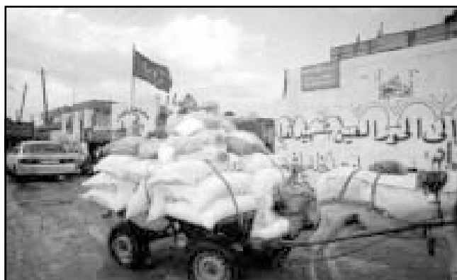
UNRWA emergency food distribution

Check the UNRWA website for more details on UNRWA assistance and current emergency programs, www.unrwa.org