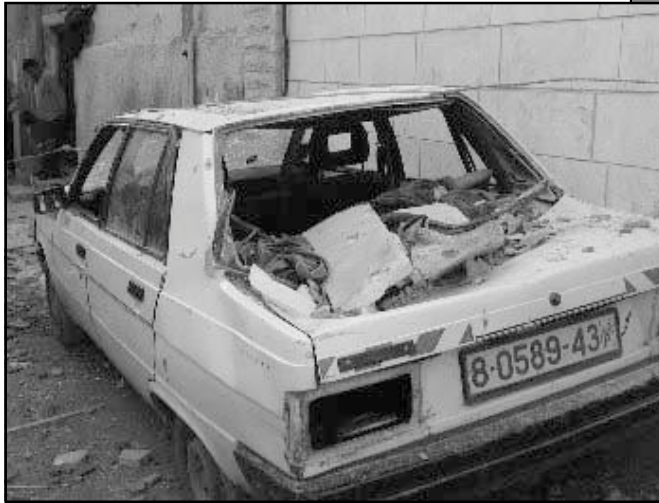
Damage to 'Aida Refugee Camp in the Bethlehem area due to Israeli shelling in late 2000