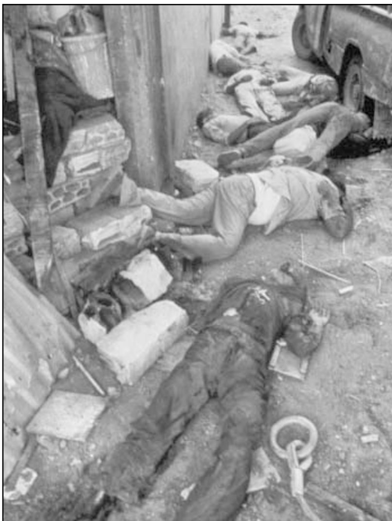
The victims of Sabra and Shatilla

An examination of Newsweek's coverage of the massacre is revealing as an example of how Western media highlighted its macabre aspects but buried its political and legal implications. Its September 27, 1982 issue (more than a week after massacre news was carried by the wire services) has a cover picture of Grace Kelly with a small patch headline: "Massacre in Beirut". Inside is a 2-page article illustrated with body photographs, and one of an Israeli soldier captioned "A horrid mistake". An Israeli official is quoted as saying "We should get some credit (for