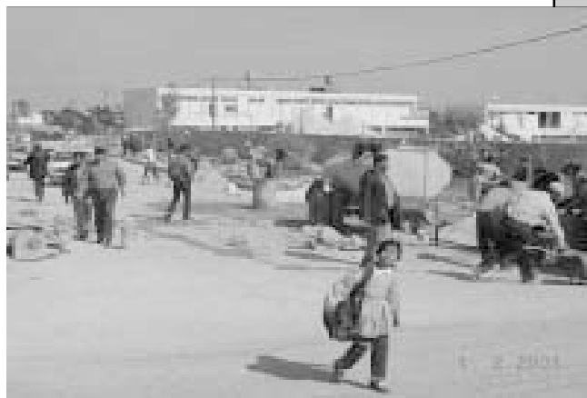
Emergency employment program

And 51 containers of flour for the West Bank were delayed at Ashdod port at a cost of US$43,000.